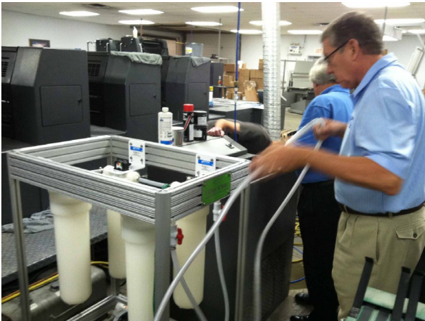
Easy installation - runs off standard house air