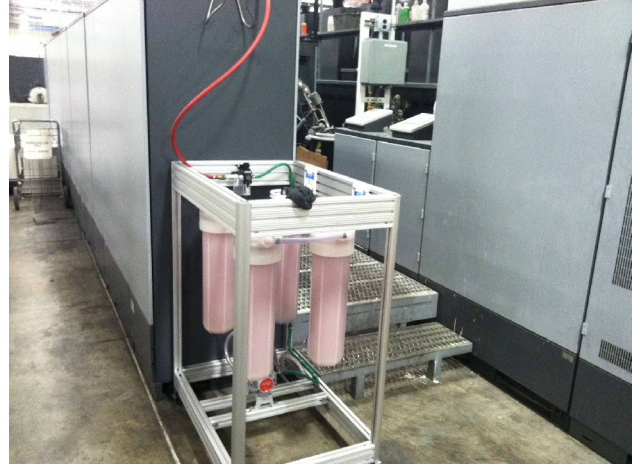
Portable and compact to fit in most areas