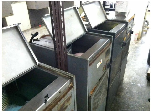
Multiple Tank Unit