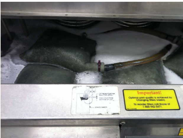
Single Tank Unit